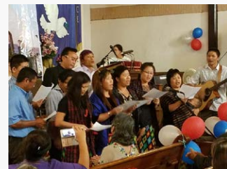
Choir from around the area