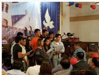
Choir from around the area