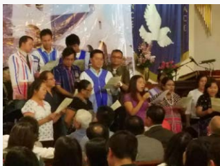
Choir from around the area