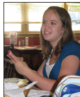
Cell phones are a "no go" during meetings, but at lunch, okay!

Otherwise, if your daughter joins the team, there will be times when she is simply out of touch!