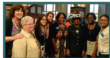
NLT meetings are hard work, but fun and educational, too! (Here the 14-15 NLT meets Martin Luther King Jr.'s sister, Christine King Farris, after worship at Ebenezer Baptist Church in Atlanta, Georgia.)

If your daughter joins the NLT, you will need to be comfortable with her missing school.